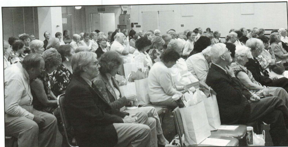
Volunteer Appreciation Night brought out a large audience of members who were acknowledged for their many hours of contribution.