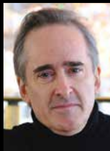
JAMES CONLON LA Opera Richard Seaver Music Director and Conductor of St. Matthew Passion