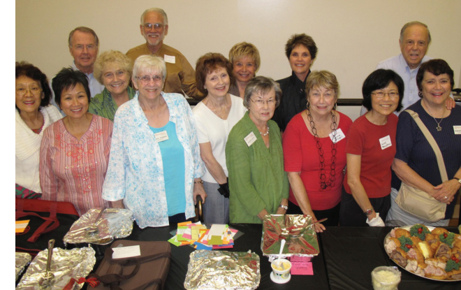
Volunteers at a Cast Dinner

This past year Opera League members donated over $3500 to support League programs. You can specify that donations be designated to support our Student Bus Transportation Fund, Student Educational Programs, Special Events, or the General Fund. You can make donations to honor someone, for a special occasion, or in memory of someone. All of this can be done on our website using a credit card, or mail your check to the League.