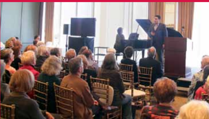
Madame Butterfly Seminar, November 2012

Order your tickets for any Opera League event on our website, www.operaleague.org .