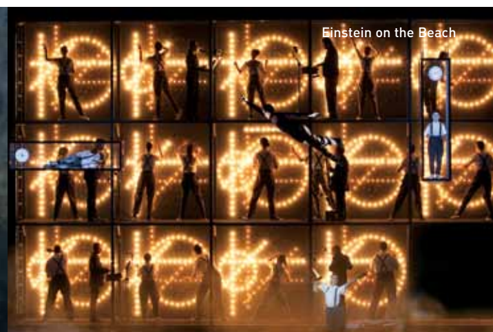
Einstein on the Beach