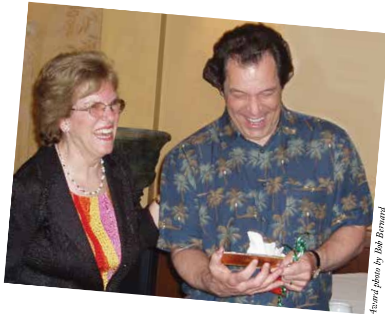
Award