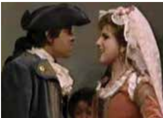
In Act One: Contentious