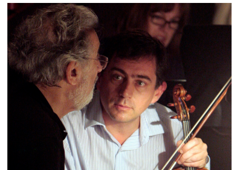
With Maestro Domingo