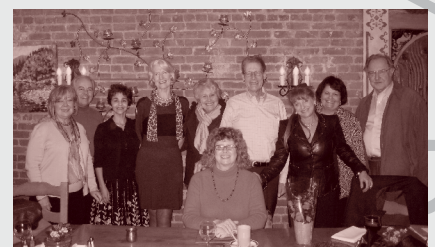
Gathering Heads Meeting