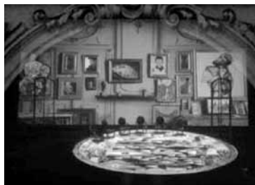
Back wall and floor projections in Die Gezeichneten