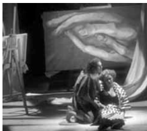
Die Gezeichneten, Act 2