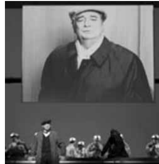
Live projection of Plácido Domingo (as Neruda)

Dual screen projections (front and rear) were used for Il Postino , with special care required for the front (downstage) scrim. LAO uses a pair of Christie projectors for this downstage