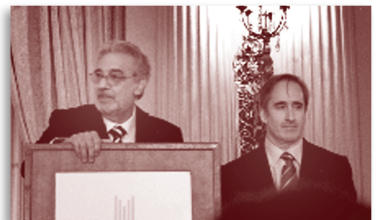
Plácido Domingo and James Conlon speaking at a previous “Preview”

So save the early days of January for this happy event, and do your skiing or sun seeking a bit later in the month!