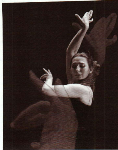
Dancing on the table at Lillas Pastia's with hands "fluttering like doves."

That this could happen is perhaps best understood by recalling the 1948 British film The Red Shoes . Moira Shearer's performance in this motion picture inspired three generations of young women to take classical ballet lessons. Now, having viewed the Saura film, I maintain that his film, in the scenes requiring