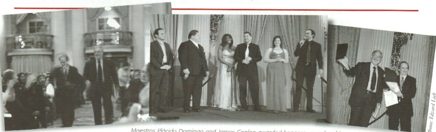
Maestros Plácido Domingo and James Conlon awarded honorary memberships in the Opera League plus the Domingo-Thornton artists at the Insider Preview.