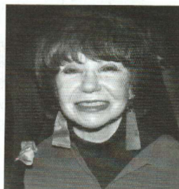
Audre Slater