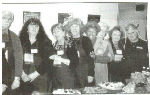
Hospitality volunteers gather at a cast dinner.

When the cast has been rehearsing for hours in full costume and has only a short break, what do these hungry performers do? They can hardly fan out across the plaza in costumes, wigs and make-up, even if this is Hollywood.